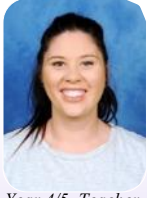
Year 4/5, Teacher

The friendly, caring and enthusiastic nature of everyone at school. I look forward to coming to school every single day