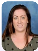
Year 5/6, Teacher

That I feel welcomed and encouraged each day, by both students and staff.