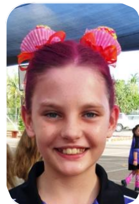
Crazy hair day